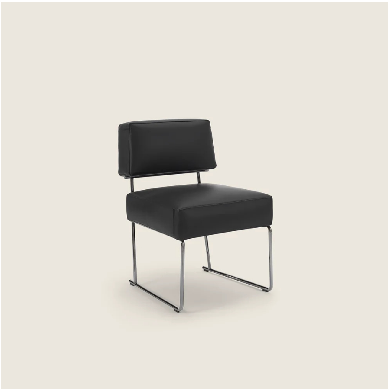
AVALON ANTONIO CITTERIO 2026 DINING CHAIRS/CHAIRS